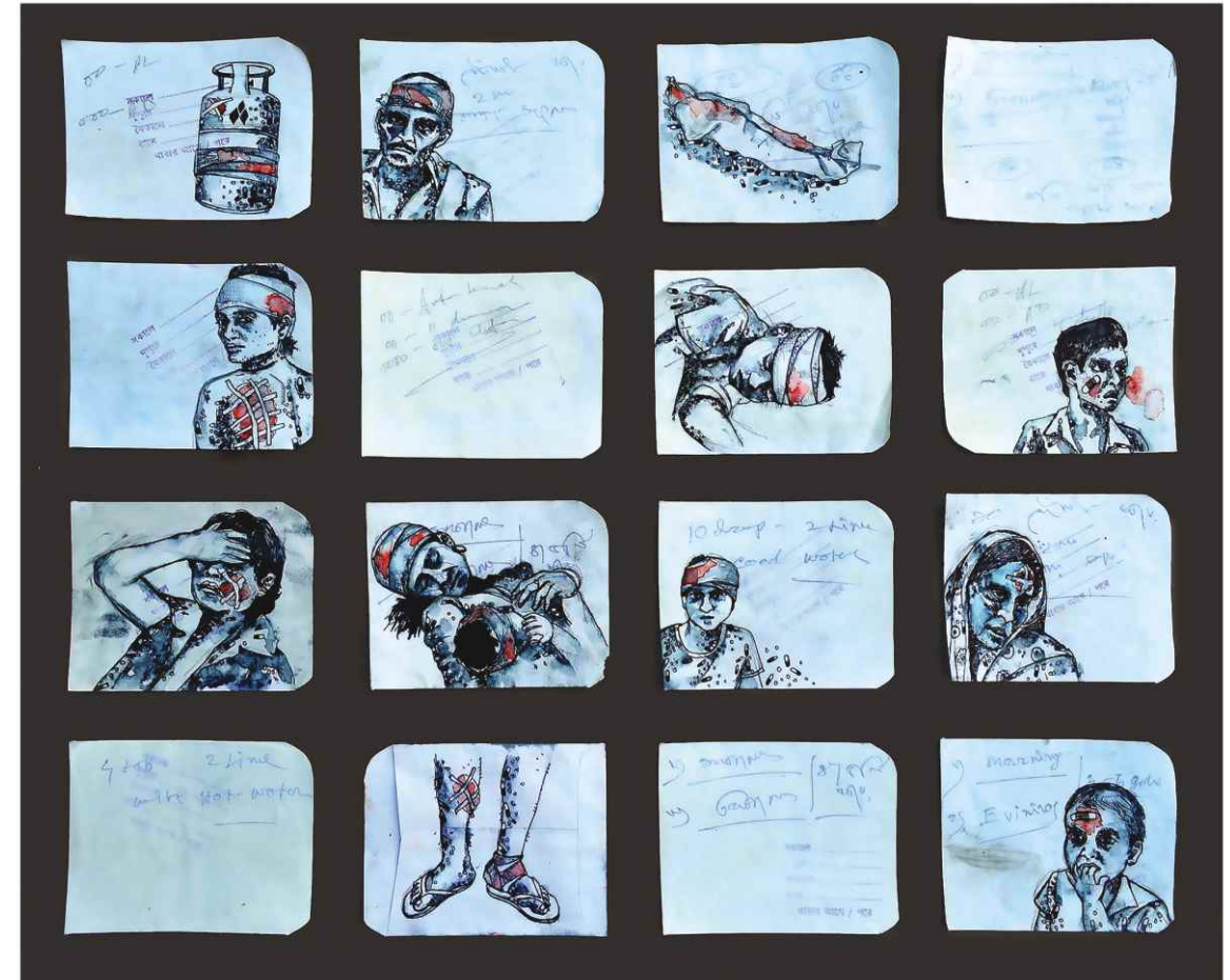
2 Goli AL/3 Goli AD Mixed Media on Used Medic Packet 12" x 14"

Shubhankar Prakash Bharti ~ Shantiniketan