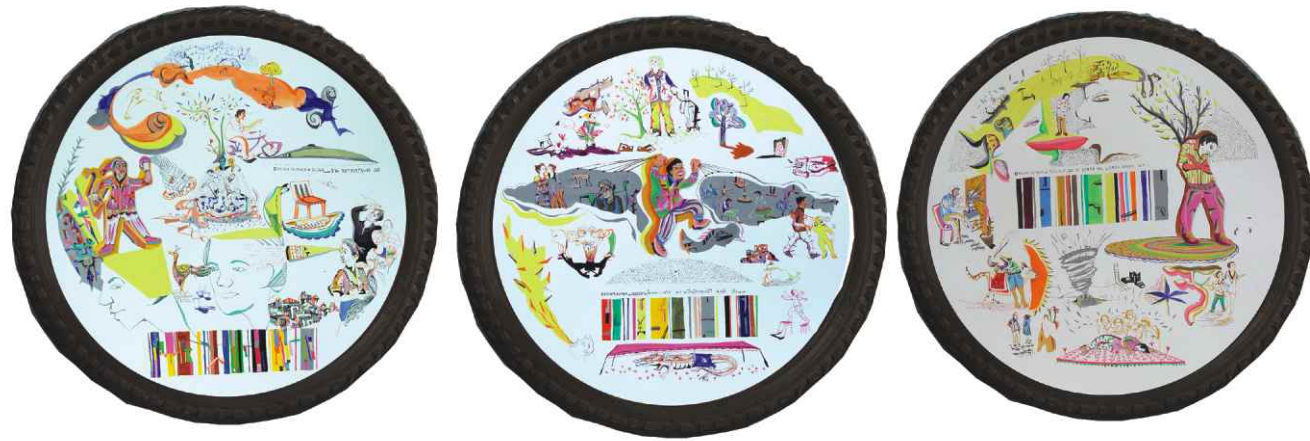
Dreams of Happiness, Dreams of Sorrows, Dreams asking me to Stay with it Acrylic on Paper & Black Tyres (19" x 19") 3