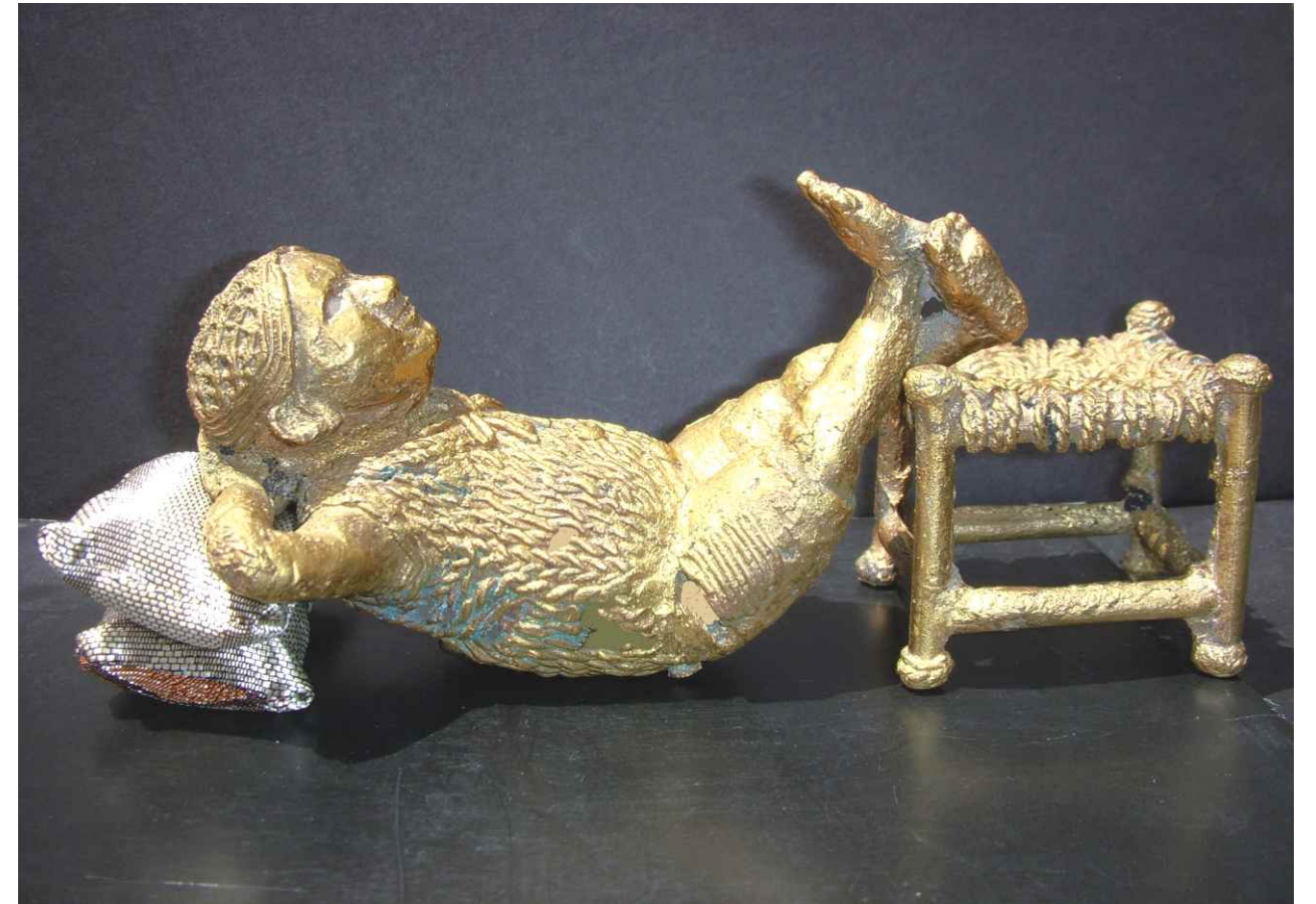
Child Dokra Metal 4" x 7" x 3"