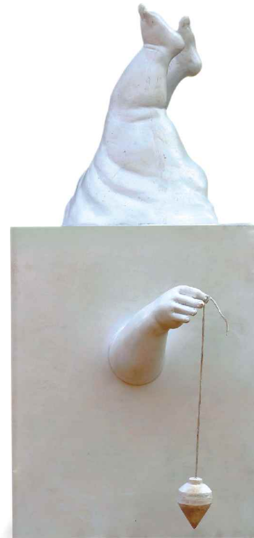
Untitled Fibre Glass 36" x 24" x 22"