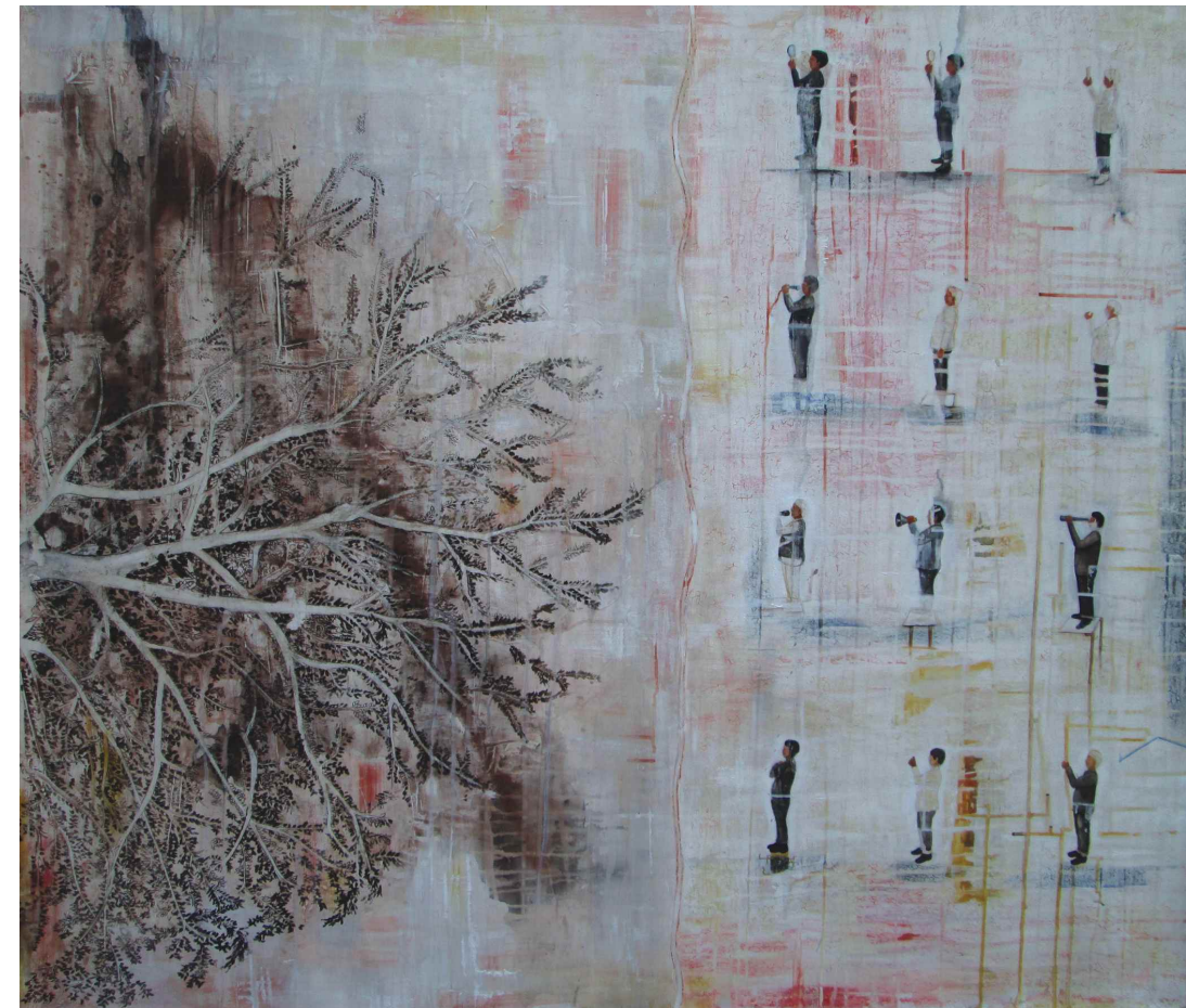
Untitled Mixed Media on Canvas 42" x 48"