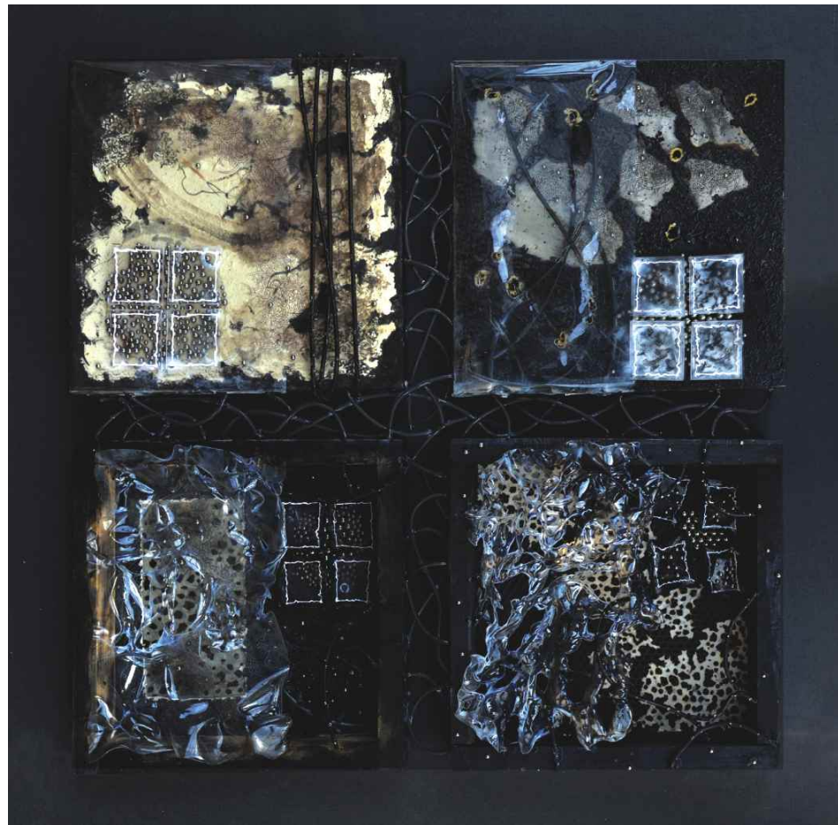
Windows of Hope Mixed Media 28" x 28"