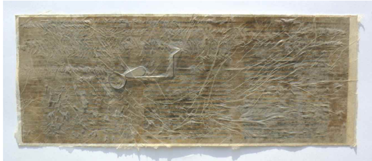
Untitled Mixed Media on Paper 10" x 26"

Shubhankar Prakash Bharti ~ Shantiniketan