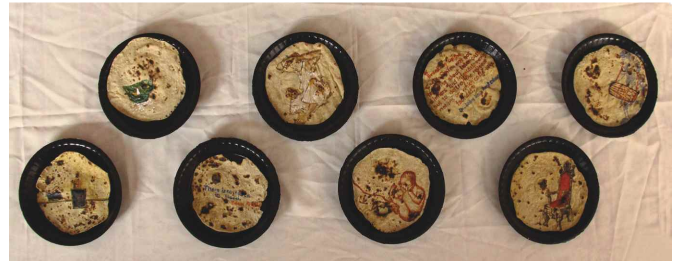
Center of Discussion (Caste) Acrylic on Roti (Bio Degradable) Variable sizes