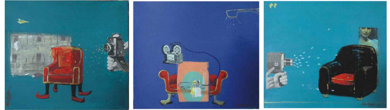
The Lost Kingdom Acrylic & Collage on Paper 8" x 30"