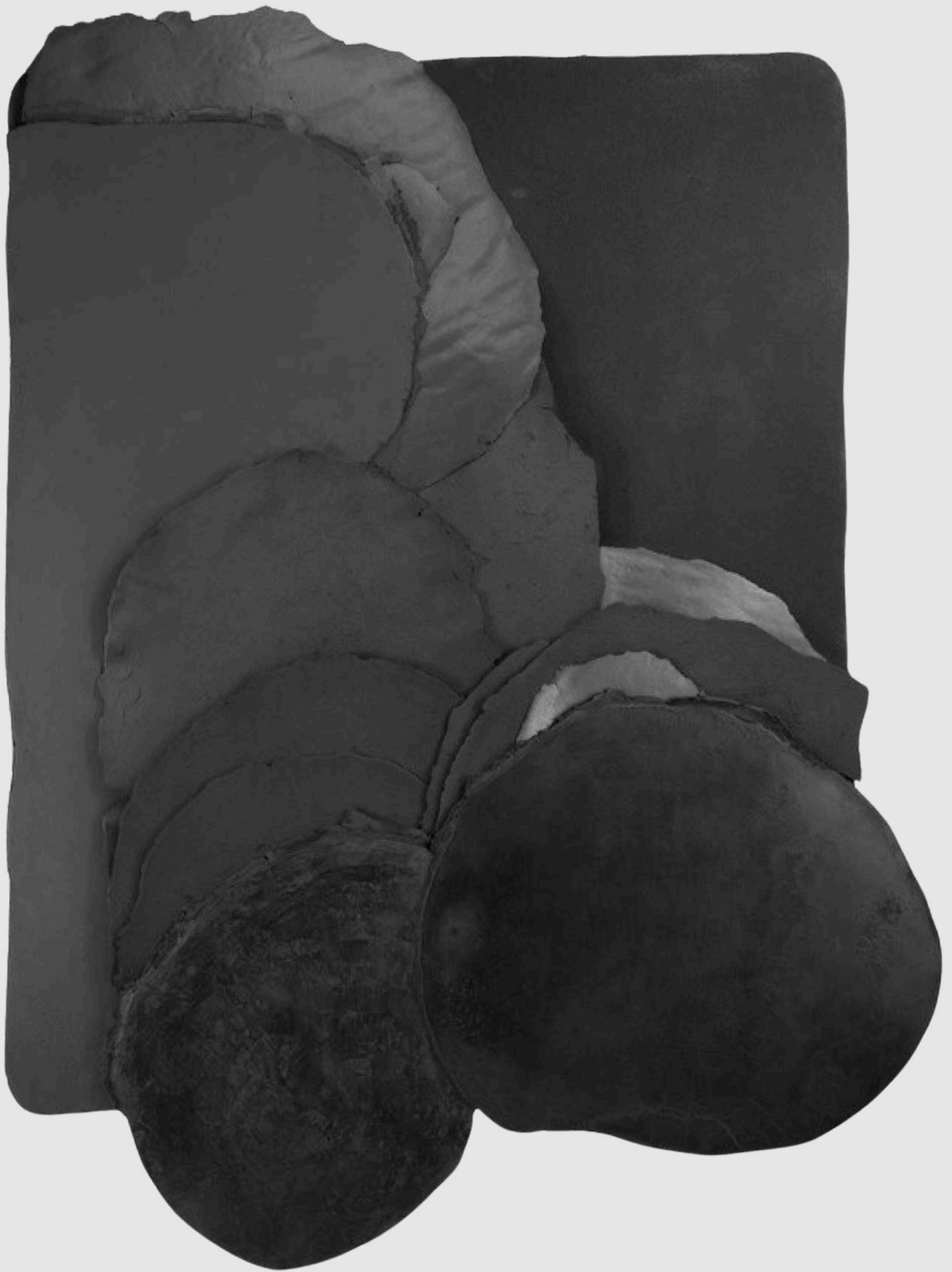
Echoed Charcoal on wood 74.4" x 54.3" x 3.5" 2025