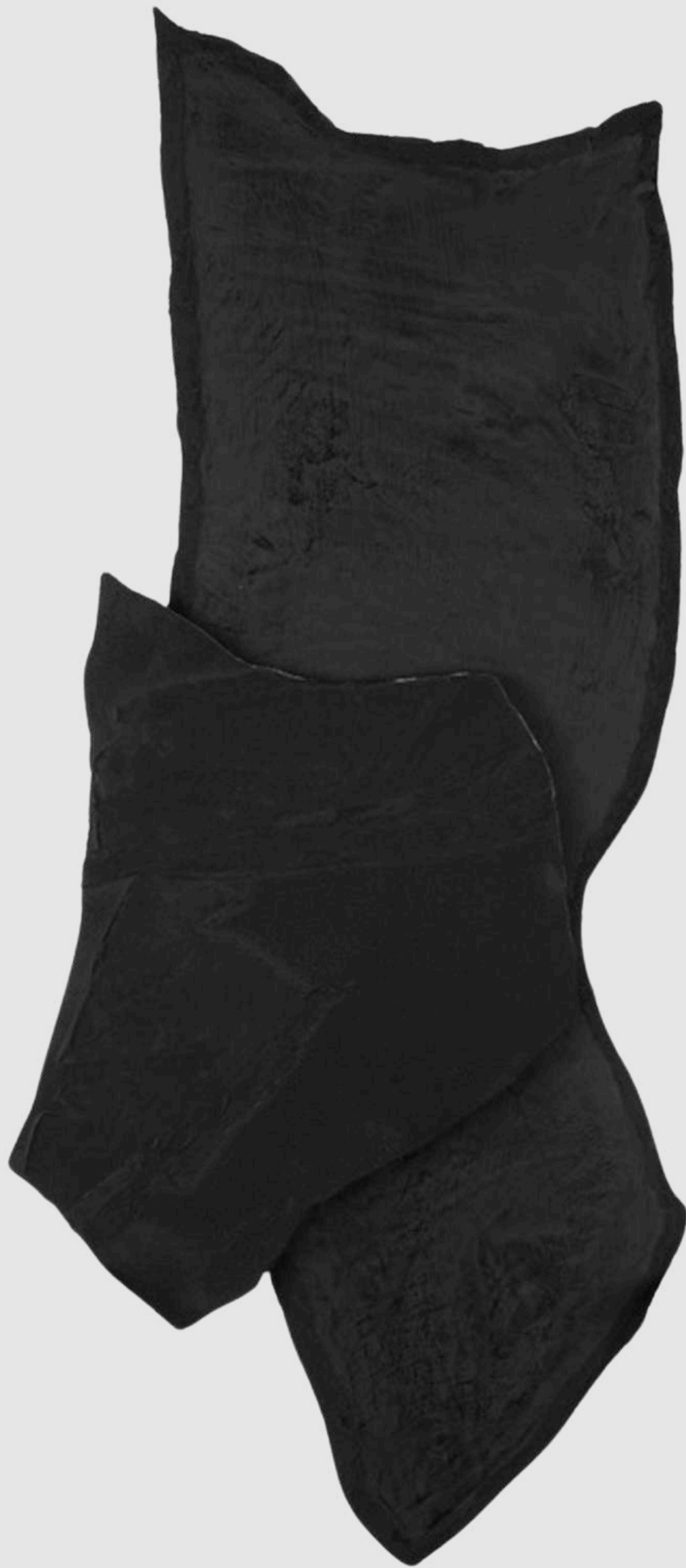
Fractured Charcoal on wood 61.0" x 27.1" 2025