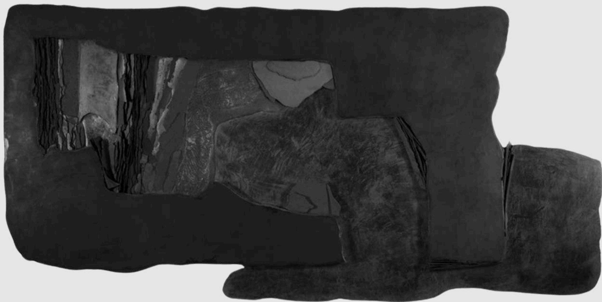
Accumulated Charcoal on wood 54.3" X 98.4" x 2.7" 2025