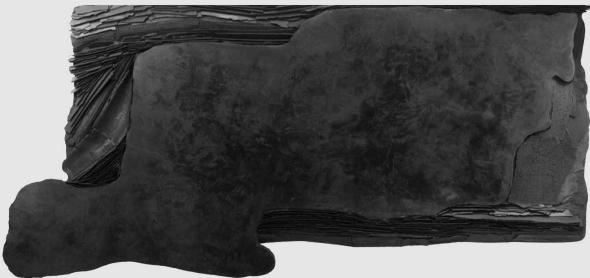
Accumulated Charcoal on wood 54.3" X 98.4" x 2.7" 2025