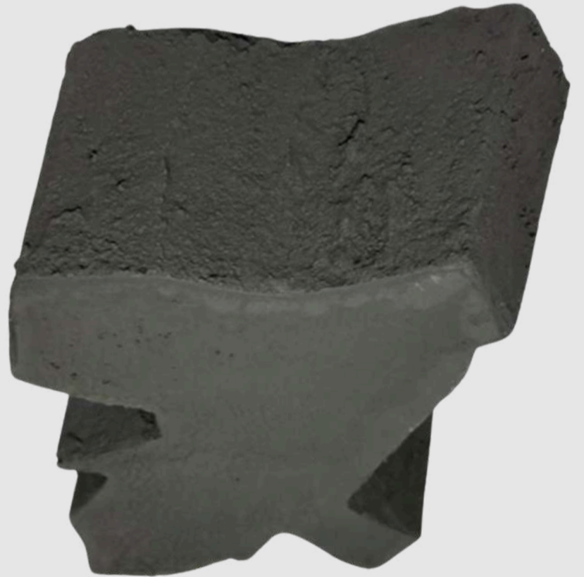
Remaining I, II, III & IV Charcoal on wood 7.5" x 6.1" x 2.9" each 2025