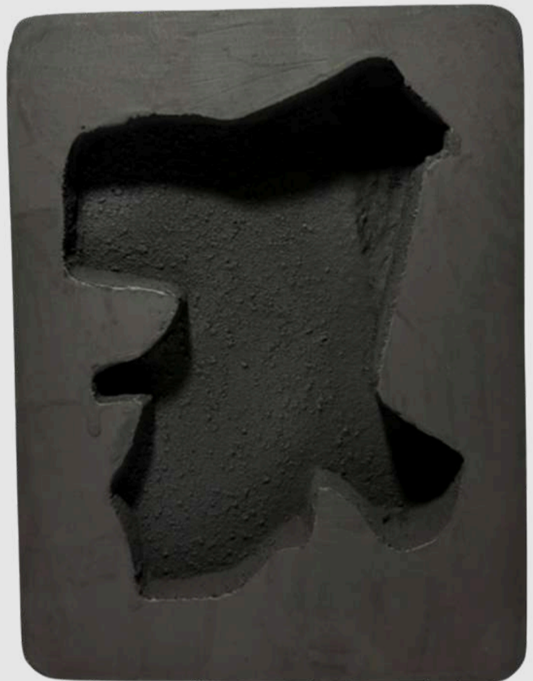
Remains I, II, III, IV Charcoal on wood 10.0" x 7.4" x 2.9" each 2025