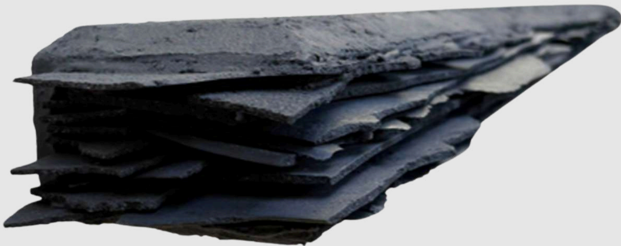
Traces Charcoal on wood 6.2" x 50.0" x 3.1" 2025