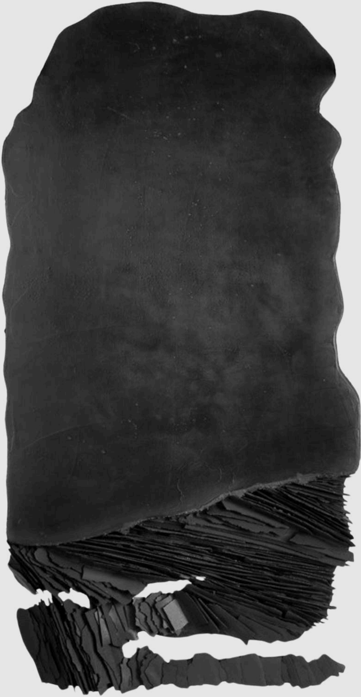
Held I Charcoal on wood 60.2" x 34.2" 2025