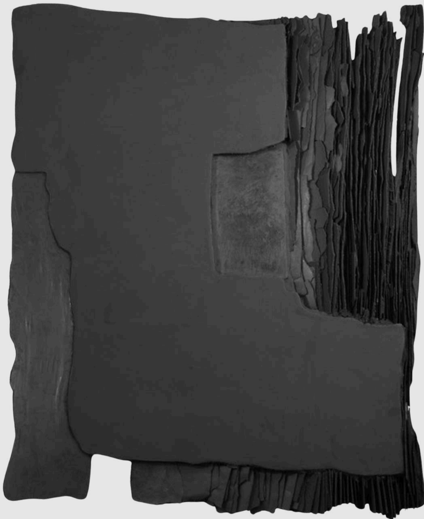
Fractured I Charcoal on wood 51.1" x 41.3" x 2.7" 2025