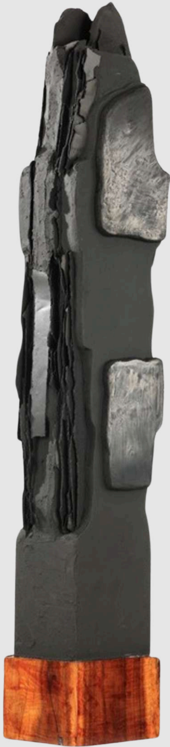
Held Charcoal on wood 51.9" x 11.0" x 9.0" 2025