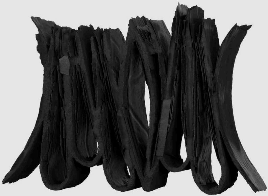
Different angles of - Bound