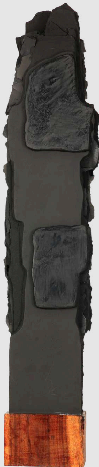
Different angles of - Held