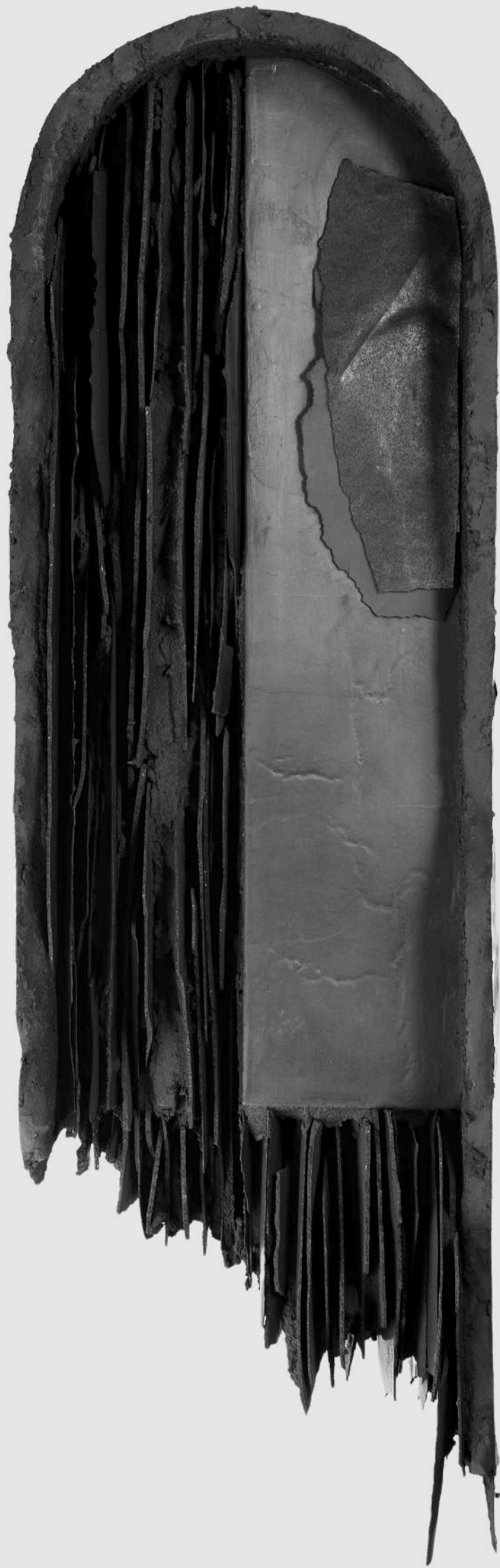
Fractured II Charcoal on wood 40.1" x 12.9" x 9.0" 2025