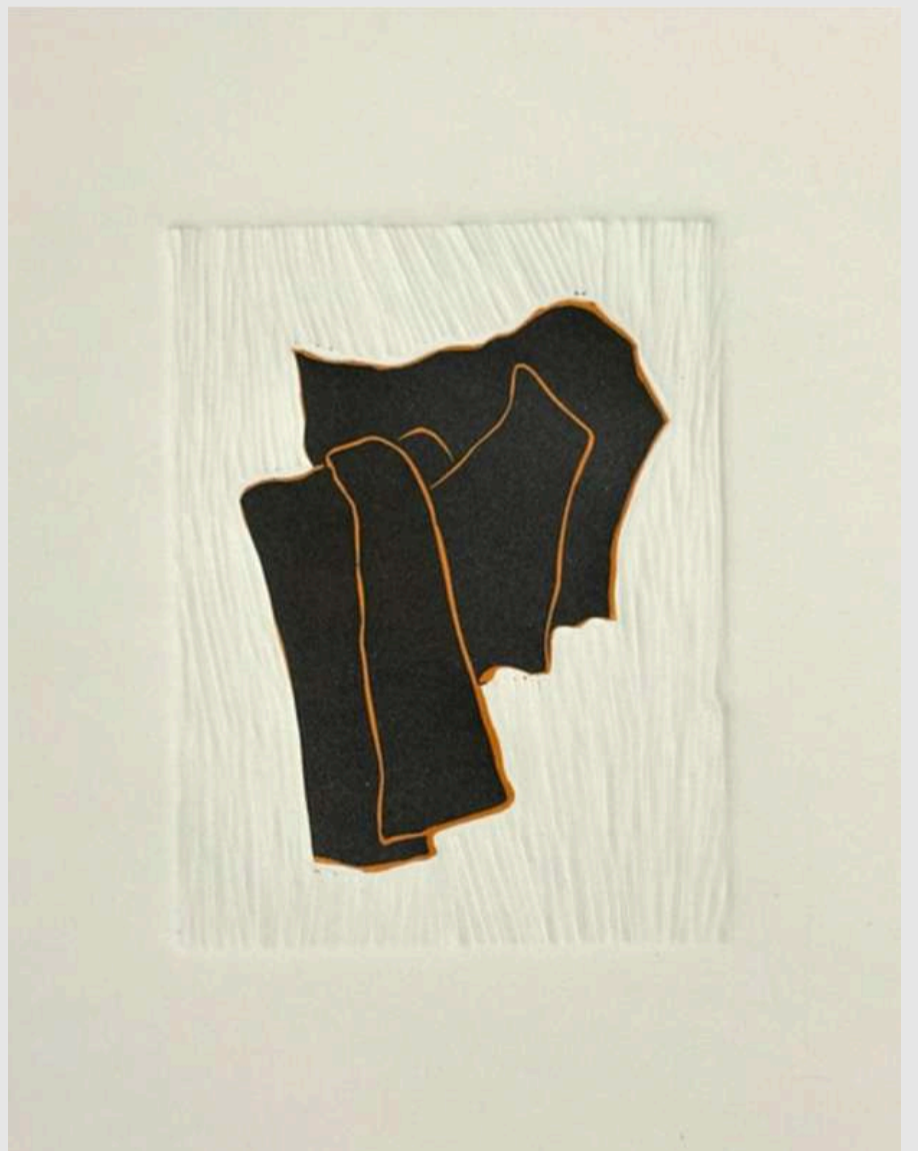
Imprints Print on paper 11.6" x 8.2" each 2025