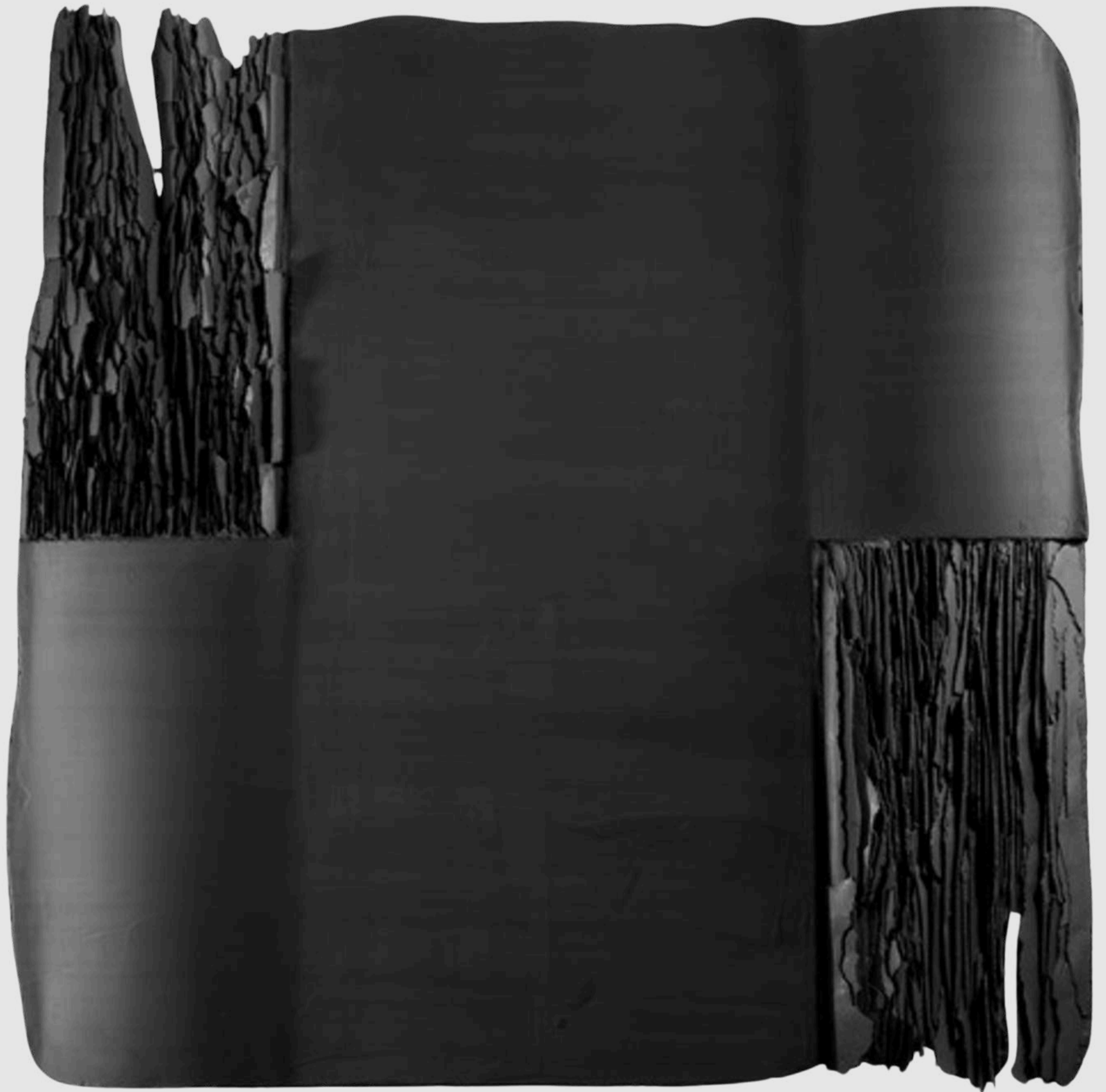
Unknown Charcoal on wood 50.7" x 50.7" x 2.7" 2025