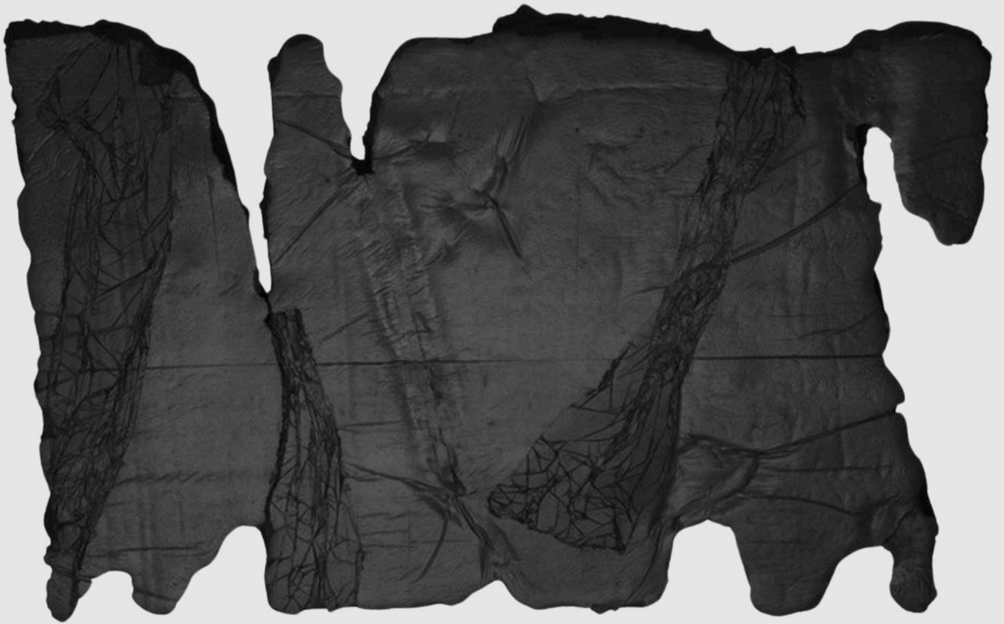
Unsettled Charcoal on wood 44.0" x 73.2" x 2.7" 2025